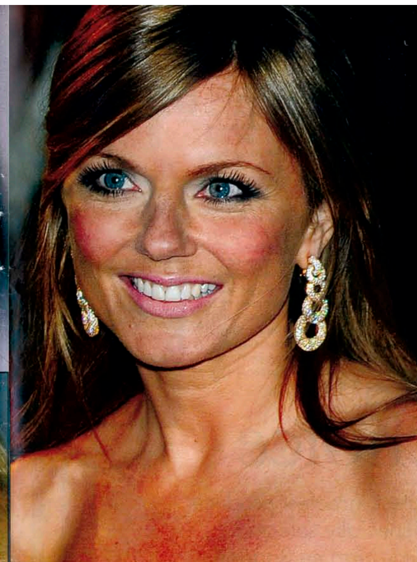
Gerri Halliwell (above) and Jennifer Aniston (below) have both tried Botox but have decided, for now at least, to let nature take its course – as has Kylie (far left). Meanwhile, Madonna's taut jawline at this year's Oscars (left) was reportedly the result of a "thread lift" or "ribbon lift"