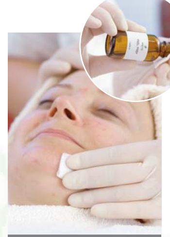
Prepping solution prepares the skin for the peel.