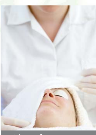
A layer of wet gauze is placed over the skin.