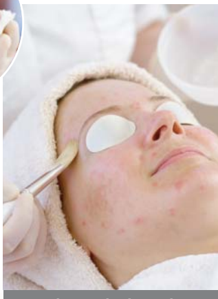
Peel is applied evenly with a brush.