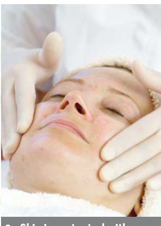
8. Skin is protected with Agera Rx® Sun Protection Factor.

The daily use of AGERA® Rx home care products in conjunction with AGERA® Rx peels will enhance and maximise your results.