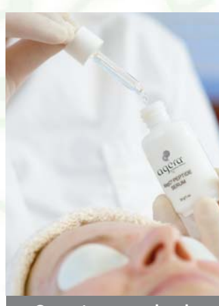
Gauze is removed and MagC<sup>®</sup> Peptide antioxidant serum is applied.