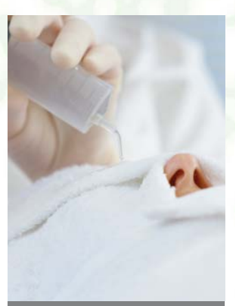
The peel is activated by the application of cold water.